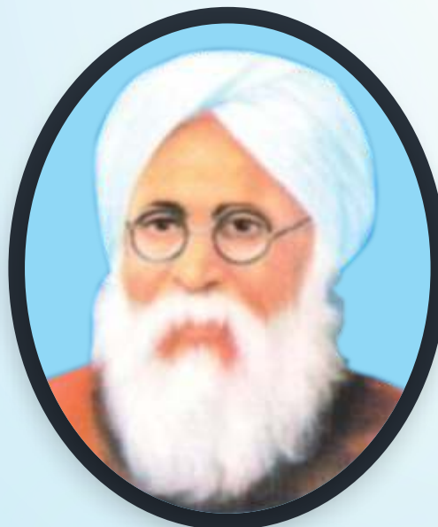
Mahatma Hans Raj (19 th April 1864 – 14 th November 1938)

Swami Dayanand Saraswati is the founder of DAV movement. He is also the founder of the Arya Samaj that brought changes in the religious perception of Indians. He worked towards reviving Vedic ideologies and brought a complete overhaul of education system by introducing Anglo Vedic schools to offer Indian students an updated curriculum, teaching both the knowledge of the Vedas along with contemporary English education. He was given the epithet of Maharishi and is considered as one of the makers of modern India.