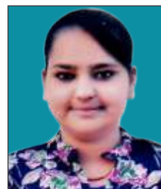
TANYA IIIrd (90.8%)