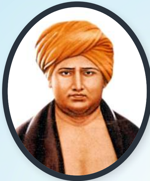
Swami Dayanand Saraswati (12 th February 1824 – 30 th October 1883)

Swami Dayanand Saraswati is the founder of DAV movement. He is also the founder of the Arya Samaj that brought changes in the religious perception of Indians. He worked towards reviving Vedic ideologies and brought a complete overhaul of education system by introducing Anglo Vedic schools to offer Indian students an updated curriculum, teaching both the knowledge of the Vedas along with contemporary English education. He was given the epithet of Maharishi and is considered as one of the makers of modern India.