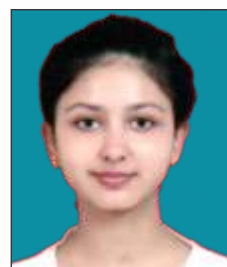
KASHMAN IIIrd (88%)