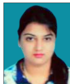
PALLAVI I Vth (86%)