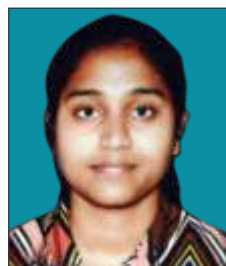
DHREETI IIInd (91.1%)