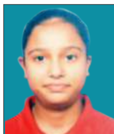
MEHEK Ist (93%)