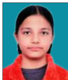
NITIKA IIInd (84%)